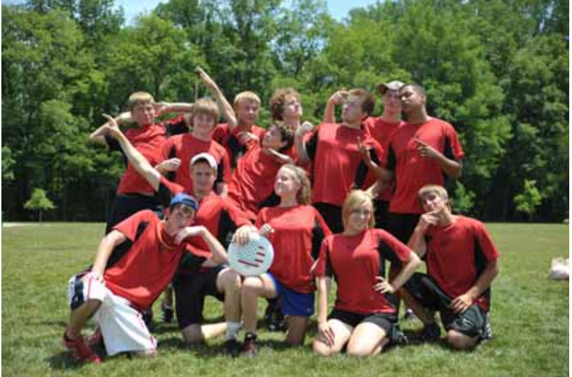
Martinsville Artesian Ultimate