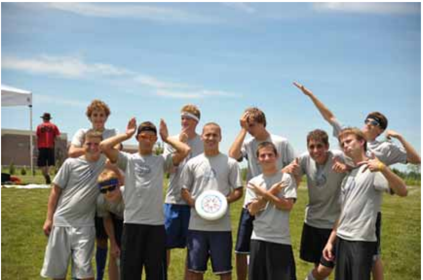
Center Grove Holy Mackerel